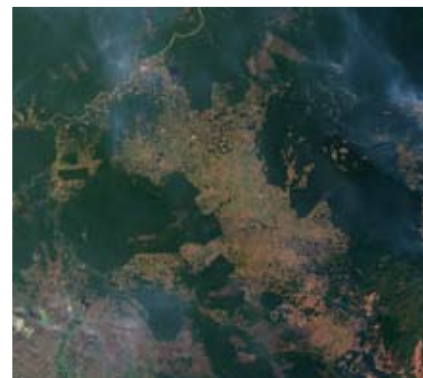
Figure 5: A satellite image showing deforestation at Rondonia. The fish bone pattern of small clearings along new roads is the beginning of one of the common deforestation trajectories in the Amazon