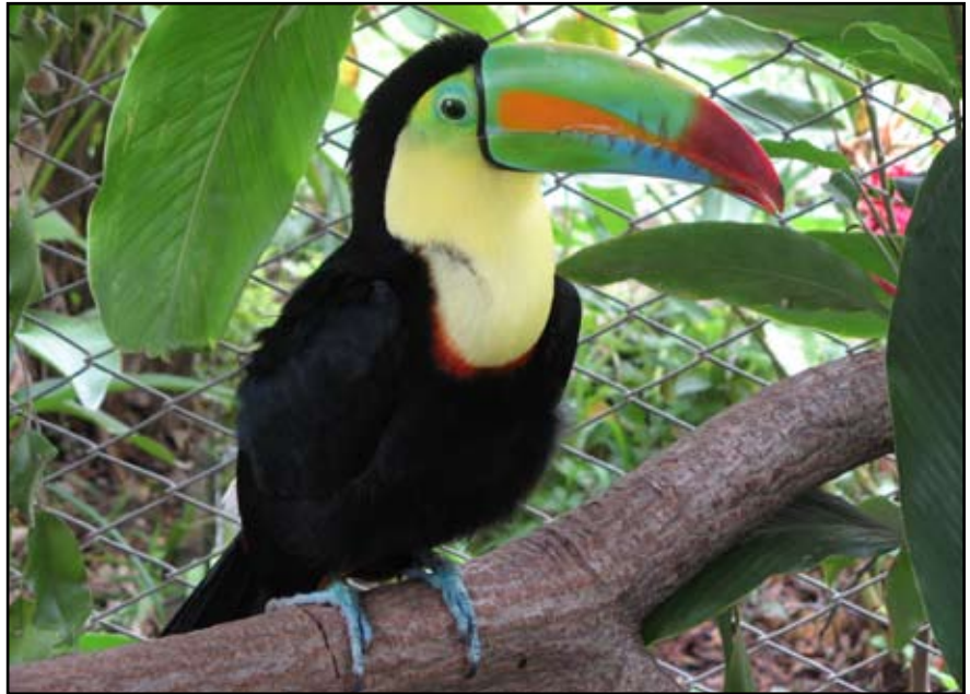
Figure 4: Keel-billed Toucan with strong, large, lightweight bill